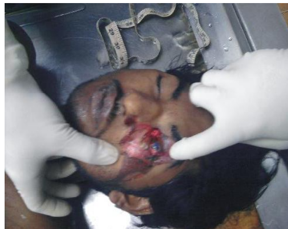
Fig 1: Ocular Injury

Authors affiliation: Associate Professor, **Resident, Dept. of Forensic Medicine & Toxicology, Kasturba Medical College, Mangalore (Manipal University), Karnataka, India.