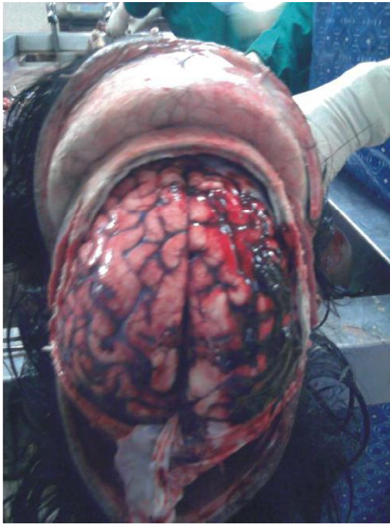
Fig 2: Injury to the Brain

nose and left side of face and zygoma was noted overlying which was a penetrating laceration (Fig 1). Left cornea was opaque in appearance. Another superficial burn injury measuring 7x2cms was horizontally present at back of left forearm, 4 cm below the left elbow joint. Internal examination revealed sub-scalpal contusion over left supra-orbital region & Sub-dural and sub arachnoid hemorrhage over right cerebral hemisphere ( Fig 2). On